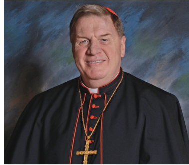
Cardinal Joseph W. Tobin, C.Ss.R. Archbishop of Newark