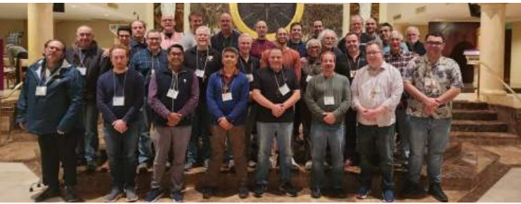
"It was a great conclusion to Men's Cornerstone XV. Thanks to all the candidates for making this a great event. Thanks to the dream team from St.Bart's and IHM truly an honor to serve with you men."