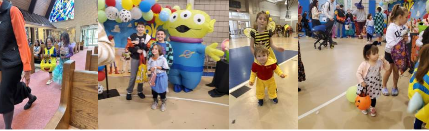
Highlights from Trunk or Treat 2023! Thank you to all the parents and children working together in making this a fun day!

Wake the kiddies and tell your neighbors! One Day Only! On Tuesday, November 7th (Election Day) 20% of all sales will benefit our food pantry! Just mention "IHM Food Pantry" at checkout. SCOOPS Ice Creamery is located at 2014 Rt. 22 East Scotch Plains, NJ.